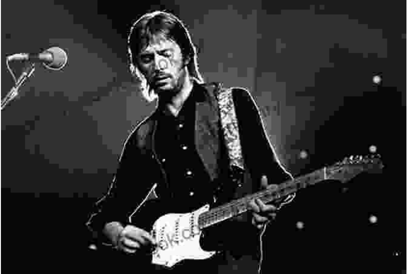
Eric Clapton playing guitar with Cream in 1967.

rock and roll. Clapton's guitar playing on Cream's albums, such as "Disraeli Gears" and "Wheels of Fire," is considered some of the best guitar playing ever recorded.