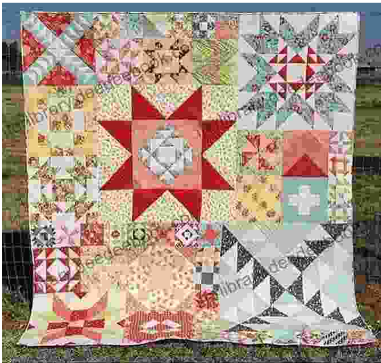
How To Make A Five Patch Star Quilt: A Sampler Quilt Made Using Five Patch Star Quilt Blocks: Quilting

Whether you are a seasoned quilter or simply appreciate the beauty of fabric art, sampler quilts offer an endless source of inspiration and delight. May you find joy in exploring the enchanting world of quilting designs and creating your own unique masterpieces that will be cherished for generations to come.