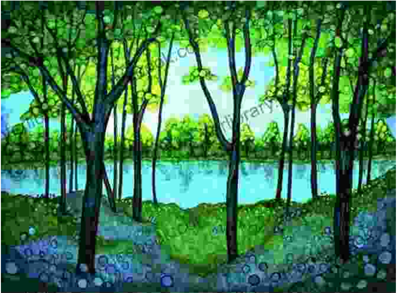
Tranquil Forest by Jane Doe

The colors in these paintings are soft and muted, reflecting the peacefulness of the forest. The greens of the leaves are lush and inviting, the browns of the trees are warm and inviting, and the blues of the sky are deep and serene.