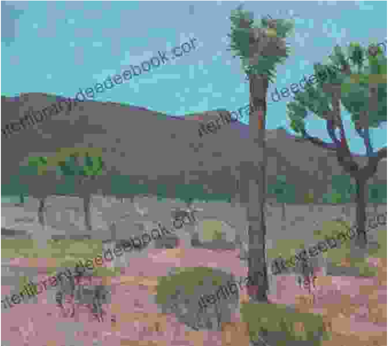
Shimmering Desert by Mary Jones

The colors in these paintings are warm and inviting, reflecting the beauty of the desert. The browns of the sand are warm and inviting, the blues of the sky are deep and serene, and the yellows of the sun are vibrant and eye-catching.